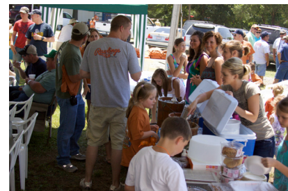
These young ladies could put Ben and Jerry's out of business anytime they want to.