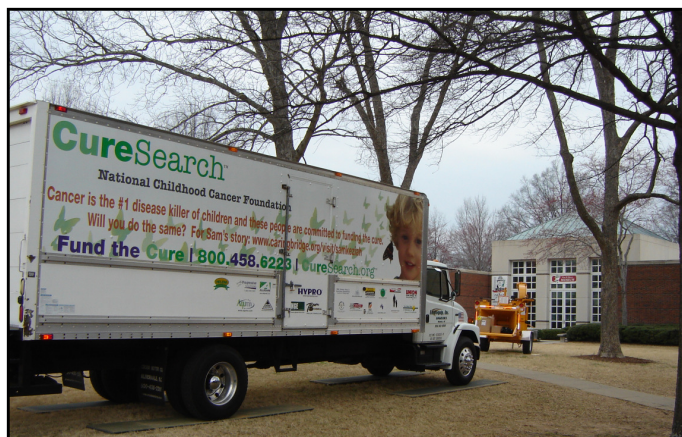
AVMS on the campus of The University of Alabama Paul "Bear" Bryant Museum in the background